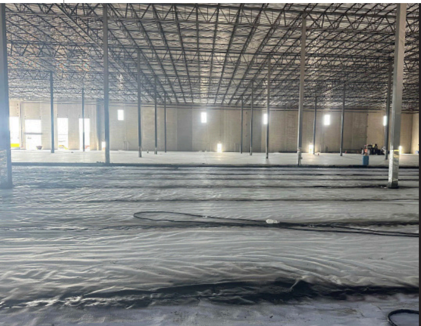
Installation of Geo-Seal 60 in progress.